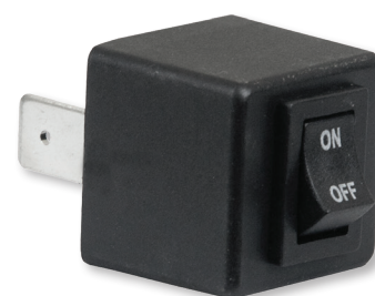
#9036-3 Large Spade Relay Volkswagen 1999-2005 Audi 2004-2006