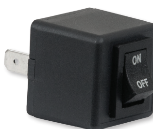
#9036-2 Medium Spade Relay Domestic and Japanese 1970-2009