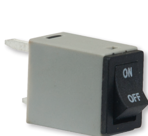
#9036-1 Small Spade Relay 2000 and Newer Domestic, Korean, and Japanese