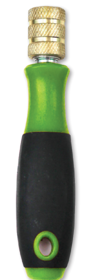
1/4" Locking Bit Head Driver