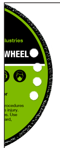
Holes Prevent Overheating and Increase Wheel Life