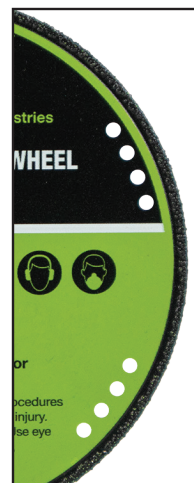
Holes Prevent Overheating and Increase Wheel Life