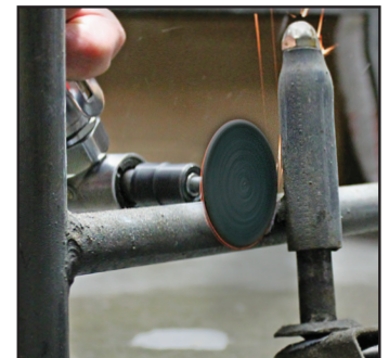
Thin Profile for Fast Cutting

BrushAll® is a division of IPA®, dedicated to the development and manufacturing of innovative brushes and abrasives for all industries.