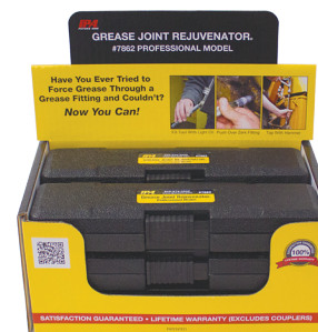
6-Pack Display #7862-6PK