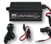
10-Amp Smart Battery Charger