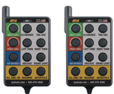
(x2) 12-Button Remotes