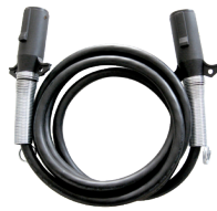
5-ft. 7-Way Cable