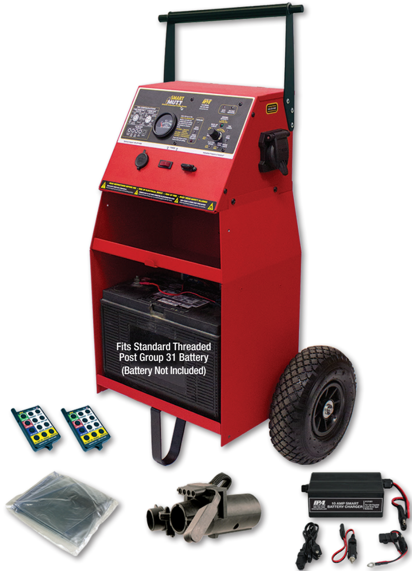
Fits Standard Threaded Post Group 31 Battery (Battery Not Included)