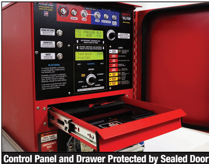
Control Panel and Drawer Protected by Sealed Door