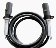
20-ft. 7-Way Cable