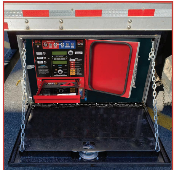
#5611A-RT8 Service-Truck Model Shown

All units are completely customizable for any need.