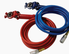
20-ft. Gladhand Hoses w/ Handles