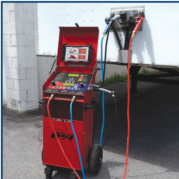
#5710A-T10 Shop Model Shown

M Series: Ask about our full line of Military and NATO Alpha MUTT® trailer testers.