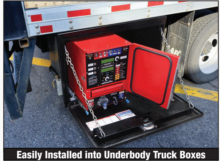
Easily Installed into Underbody Truck Boxes