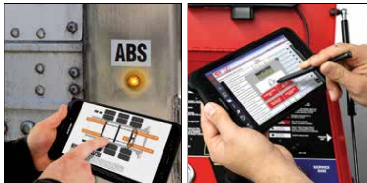
Military-Grade Tablet with Quick-Connect Docking Station #5705A Model Available with Standard Tablet