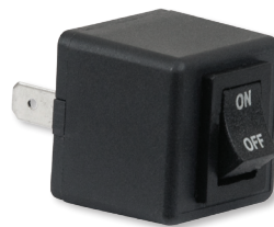
Medium Spade Relay Domestic and Japanese 1970-2009