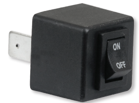
Large Spade Relay Volkswagen 1999-2005 Audi 2004-2006