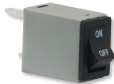
Small Spade Relay 2000 and Newer Domestic, Korean, and Japanese

Small Spade, Medium Spade and Large Spade Relays