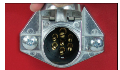
7-Way Round Pin