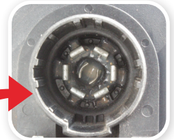
7-Way Spade/Flat Vehicle Female Socket (Front View)