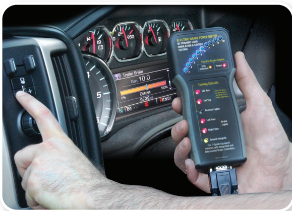
Real-Time Brake Force Output Gain and Timing