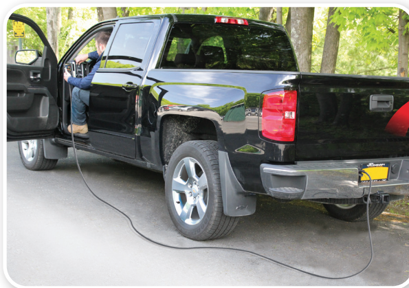
Complete One-Man Solution